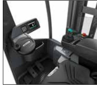
Spacious operator compartment