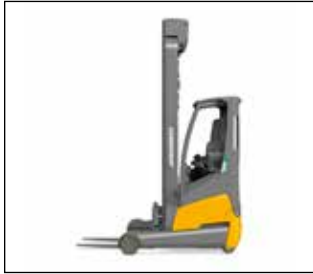
Optimum view of the base legs